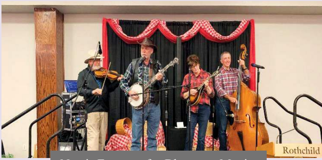
Norris Freeway for Bluegrass Magic